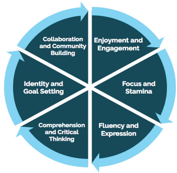
7 Strengths to Open a World of Possible , by Pam Allyn and Ernest Morrell. Published by Scholastic, 2015.

Powerful literacy classrooms are spaces where teachers are reading aloud to students and helping students to critically engage texts. They are spaces where students have a chance to read on their own texts of their own choosing. Where students write for purpose and joy to share with authentic audiences; where students write as a part of genuine inquiry and research. Where students have opportunities to connect to digital technologies and raise their voices in a polyvocal classroom. Powerful literacy classrooms are places where teaching is culturally responsive and honors all the ways that young people bring culture into the classroom. Culture is not only ethnicity and race, language, religion, and age. Children and teens belong to youth cultures and local geographical neighborhoods and communities. Culturally responsive teaching means seeing every child as multicultural. Finally, powerful literacy classrooms are places where teachers consider the social and emotional aspects of student learning.